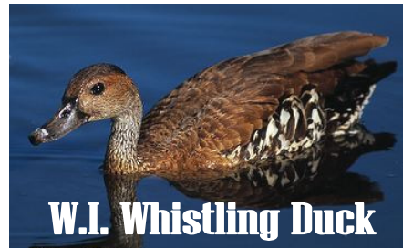
W.I. Whistling Duck