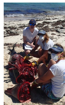
BMMRO performs a necropsy on a deceased beached dolphin