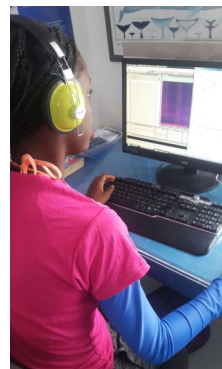
Student listening to boat and animal noise recordings