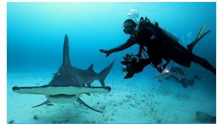
Each shark is worth $250,000 ALIVE on the reef for tourism!