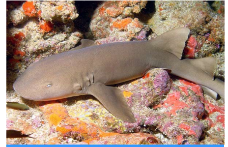
Humans pose a far greater threat to sharks than they pose to us.

Posters from participants will be scanned and posted throughout the community in recognition of student efforts to help preserve the oceans on which we depend.